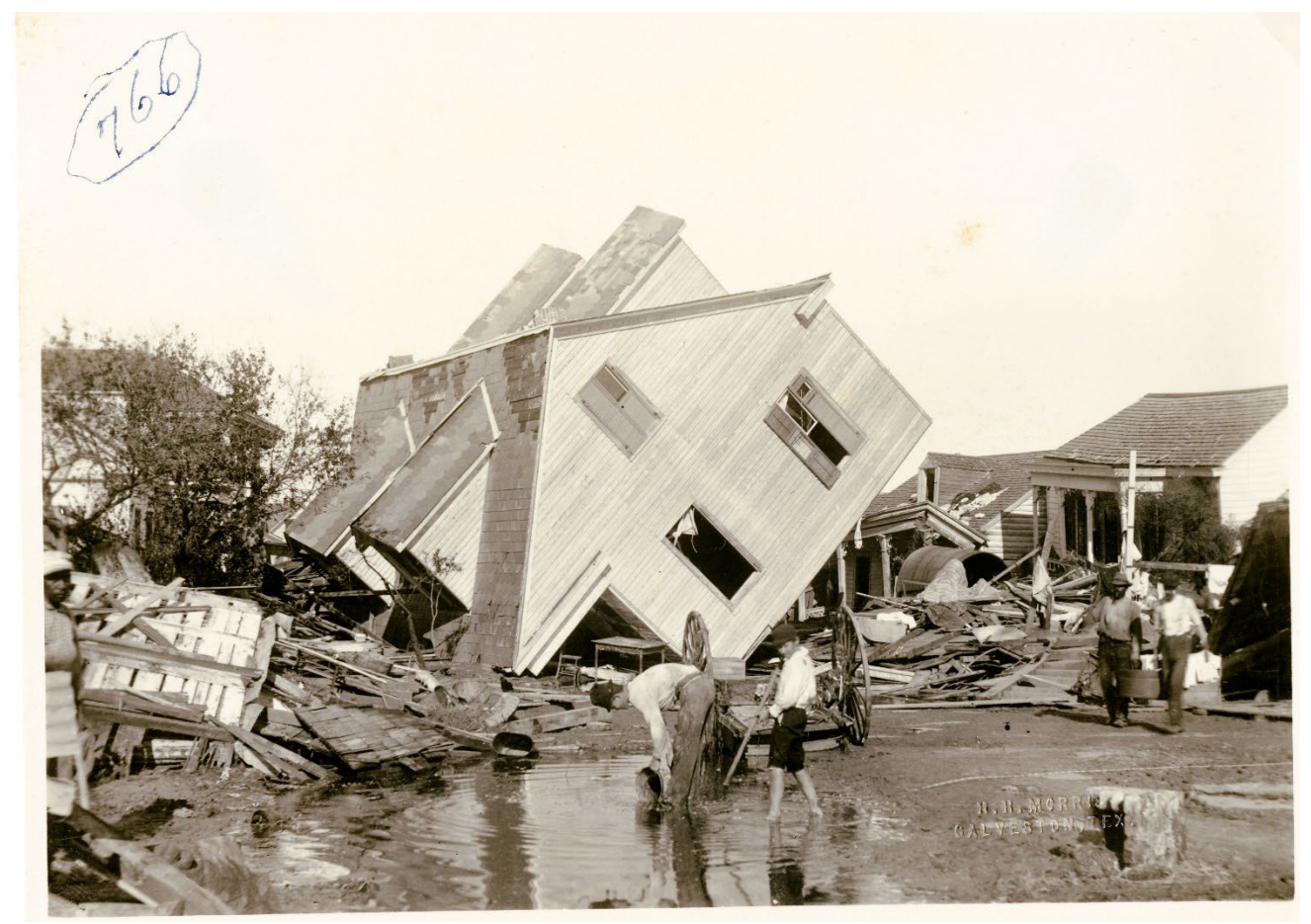
Men working near an overturned house after the Great Storm. © 1900 Henry H. Morris. Courtesy of the Rosenberg Library Galveston, Texas. All rights reserved. This image has been cropped.

Texas had seen rain before, plenty. It had flooded before, many times. But on 25 August 2017, Hurricane Harvey dumped a volume of water never before contemplated. The storm had become wedged between two weather systems, one trying to push north, the other south. At landfall, it was 450 kilometers in diameter, with 209 kilometer-per-hour winds. Its circulation, extending well out over the Gulf of Mexico, brought a continual flow of moisture. When Harvey stalled out over the Houston-Galveston area for four days, it dropped 60 centimeters of rain in the first 24 hours in certain areas. Due to the region's vast expanses of impermeable roads, parking lots, sidewalks, and rooftops, all built on a flat coastal plain, there was no place for the water to go for days. At the storm's peak, one-third of Houston was underwater, and at least 68 people in Texas died from the direct effects of the storm.