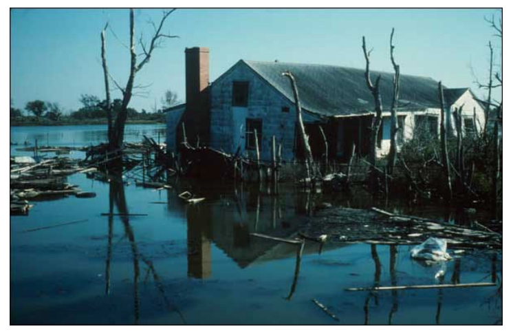
Brownwood. Courtesy of US Geological Survey, Department of the Interior/USGS. <u>Public domain</u>.

But flooding, while certainly a function of rainfall and storm surge, was largely a product of human-induced subsidence. subsidence," "Extensive write two geologists, "caused mainly by groundwater pumping but also by oil and gas extraction, has increased the frequency of flooding." More specifically, "as much as 3 meters of subsidence has shifted the position of the coastline...." <sup>3</sup> But eventually the coastline pushes back: rivers, aquifers, and embayments find their natural settling points. And all this without considering climate change.