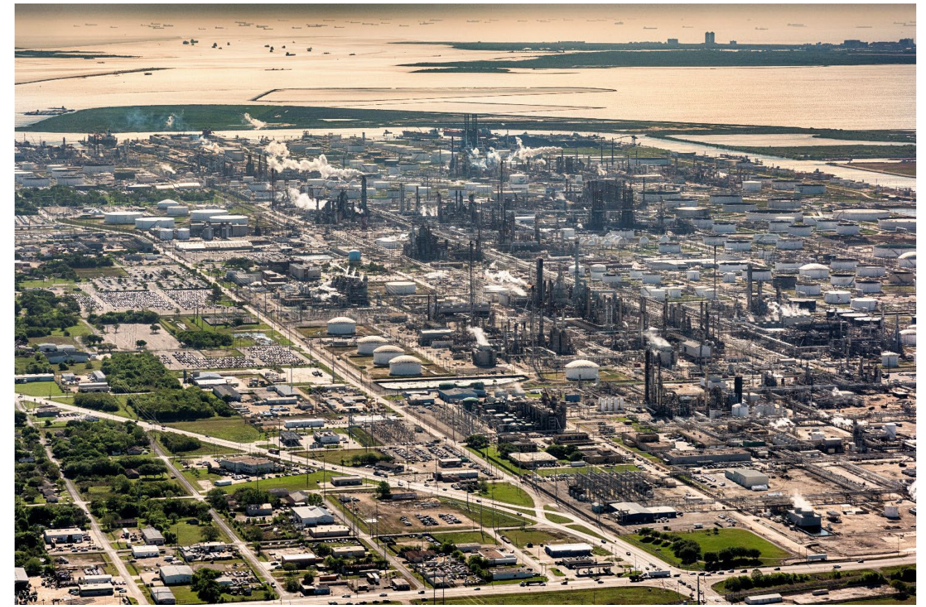
Texas Oil Refinery.

"Galveston's" oil-and-gas rush consumed the region. It consumed freshwater supplies, causing the land to subside, and, in turn, consumed an oil field and a neighborhood. It consumed land and water with its toxic dumping as well as the climate-stabilizing components of the atmosphere and oceans. Maybe, one day in the not-too-distant future, it will also consume the "pioneering spirit"—what for many peoples has been a colonizing spirit and, for future generations, a depleting spirit.