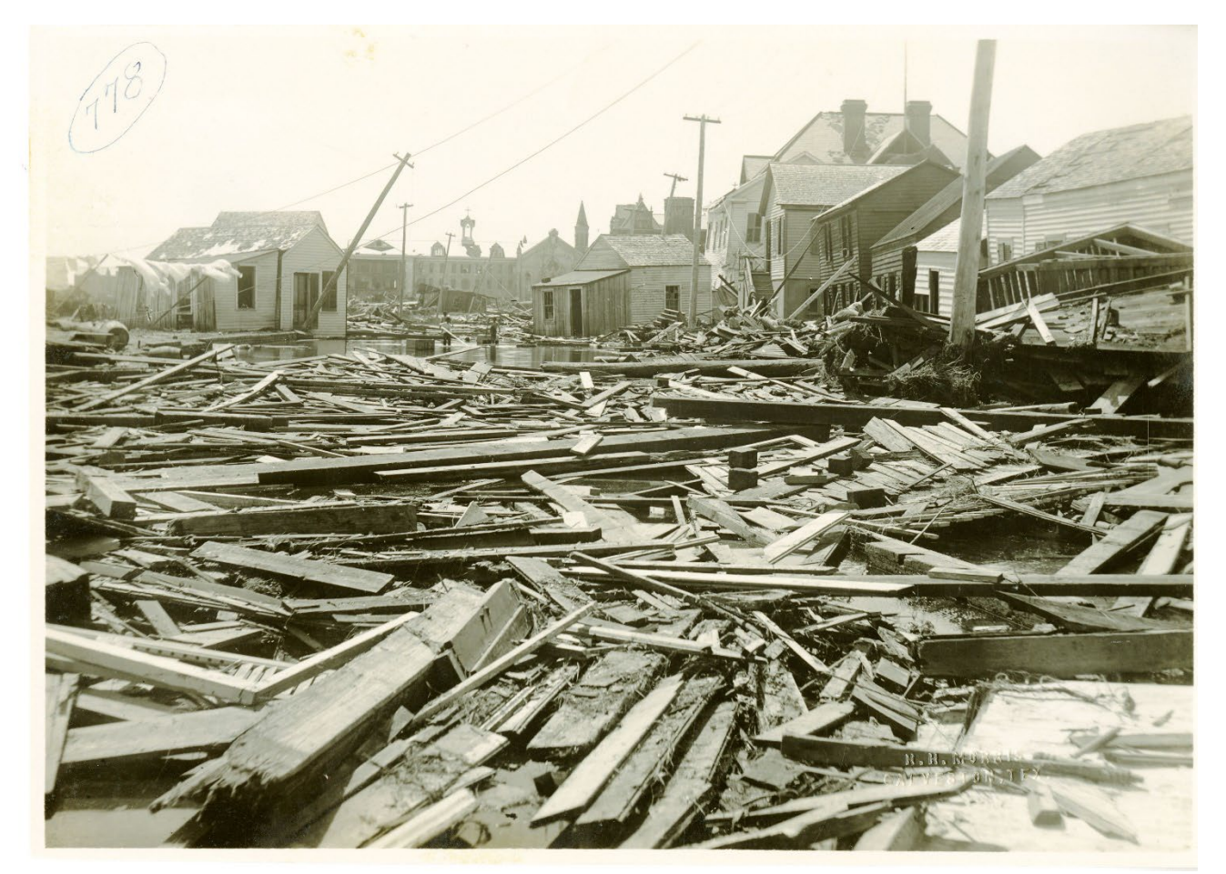
Debris near houses after the Great Storm of 1900.

The lesson of the Great Storm for First Peoples was likely a confirmation of what they had known and passed down for generations—that the island and bay are bounteous places, but they can be deadly as well. Visit, even camp there for short periods, but do not stay, especially in late summer and early fall. The lesson for Second Peoples was different: rebuild for some, migrate further inland for others. The upper bay may not be ideal, but at least it is better protected—with precautions, a permanent year-round settlement is possible. Little could they have known, in the nineteenth century, that this frontier mode could be continued for another century and more with underground extraction. And little could they have known that, like so many migrations, each phase is only temporary, each place, from Galveston Island to the uplands, only a way station until people learn to live in their place, until the economy matures past mere extraction.