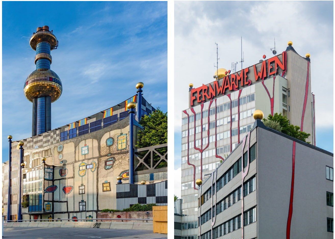
(Left) The Fernwärme Wien, a modern, operational example of the type of fully functional, yet also aesthetically incorporated, district power plant championed by Rietschel and the Assembly of Heating and Ventilation Professionals. (Right) The Fernwärme Wien central office.

The new heating technology toward the end of the nineteenth century can also be understood in the context of the rise of modern science. It began a conversation about new technological and environmental knowledge-about air composition, heat circulation, reactions of human skin (and wood) to heat, and emissions and their harmfulness. This information, in turn, led to new critiques of these technologies and the ways they were being used.<sup>24</sup> Many of the speakers at the congresses made impassioned pleas for their subject to be recognized as a science. The Technische Universität (TU) Berlin took the first step toward this goal with the creation of the world's first university professorship for ventilation and heating in 1885. The first chair, Hermann Rietschel, a rising star in the field of heating, was just 38 years old and did not hold a doctorate. Two years later, he had built a test station for heating and ventilation systems (Versuchsstation für Heizungs- und Lüftungseinrichtungen) from scratch. Today, TU Berlin honors his legacy with the Hermann Rietschel Institute for Energy, Comfort, and Health in Buildings.