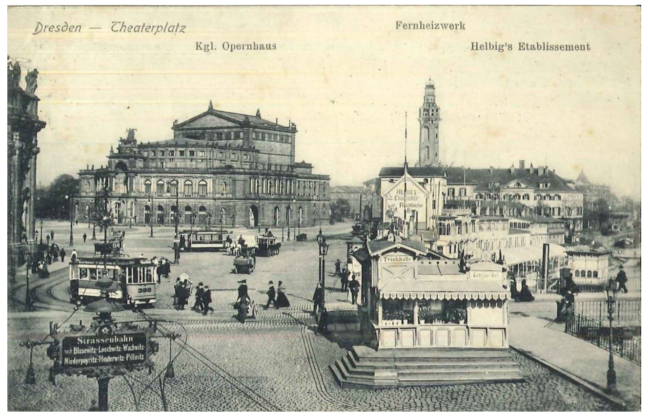
Postcard showing Dresden's Theaterplatz (Theatre Square) with the Royal District Heating and Electricity Plant on the right, 1908. All rights reserved.

chimneys . . . are so terribly insulting to this foreigners' paradise, pensioners' idyll, and dignified royal seat,"<sup>3</sup> were sure to have been pleased.