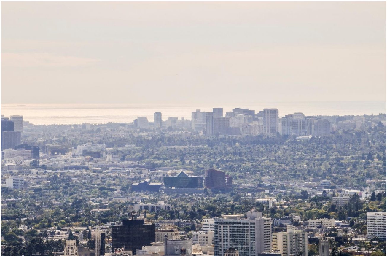
Cityscape of Los Angeles.

These important contrasts, however, make comparing the two cities' history more, not less, interesting: Why did two cities, radically different in their cultural origins, come to resemble each other in size, cityscape, and perhaps even in temperament? Why has each grown from inconspicuous beginnings to a giant metropolis over the past century, and why have they attracted millions of inhabitants?