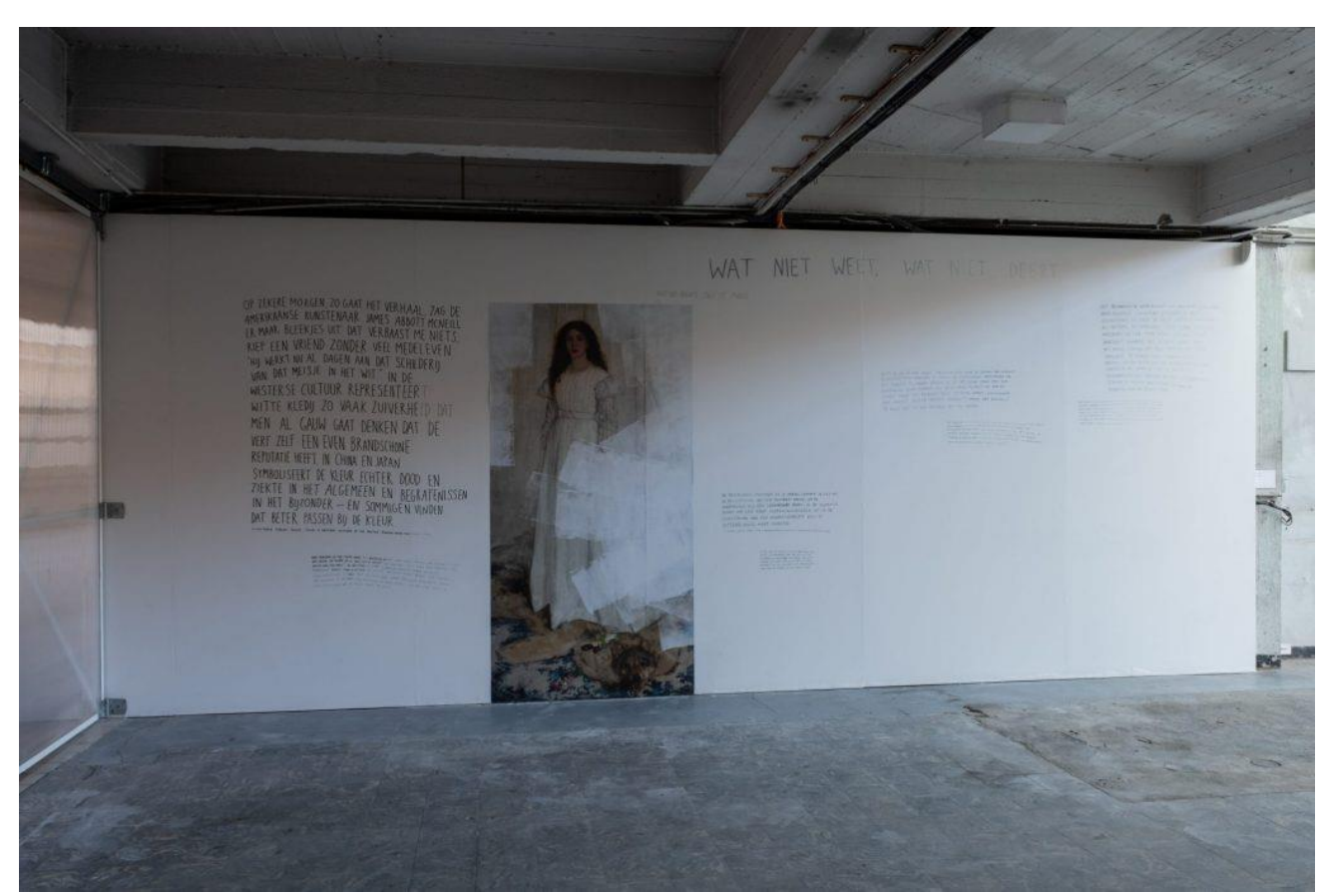
Adrien Tirtiaux, Toxic Tales, 2019, Deadly Affairs (23 March–30 June 2019), Kunsthal Extra City, Antwerp.

The initial effects of this poisonous substance matched historical beauty parameters in particular regions; it made women pale, ethereal, like some sort of supernatural (whiter than white) spirit.