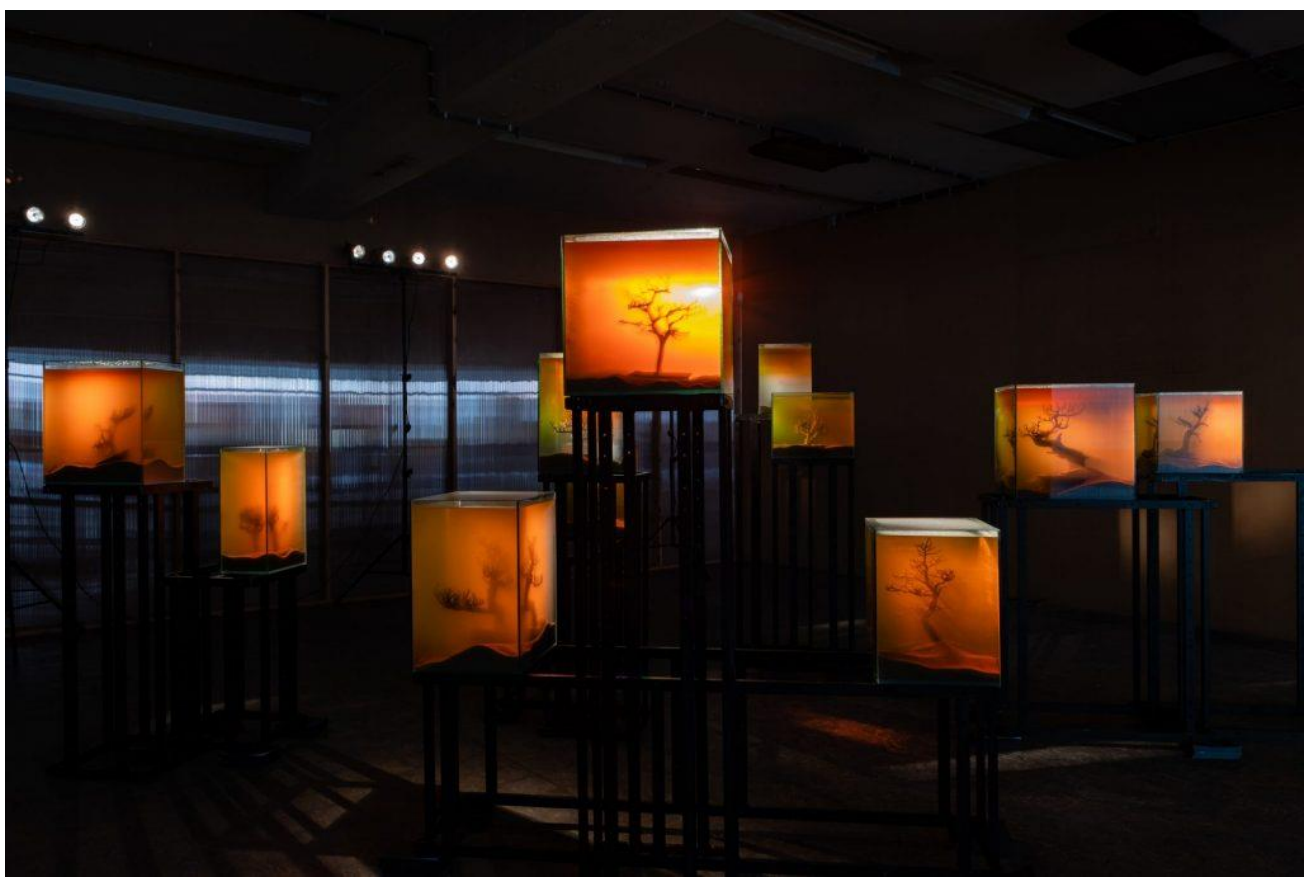
Various artists, toxiThropea.sunset, 2019, Deadly Affairs (23 March–30 June 2019), Kunsthal Extra City, Antwerp.