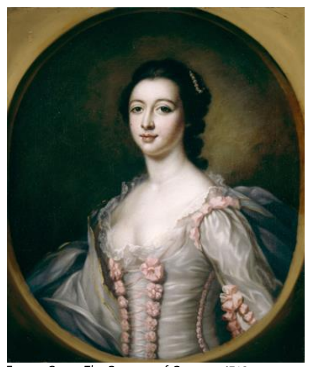
Francis Cotes, The Countess of Coventry , 1760.

This pigment's poisonous effects have been known since at least the Roman Empire. Pliny the Elder included lead white in his Natural History.<sup>5</sup> Despite this, it was only over the course of the twentieth century that its legal distribution in the West ended.<sup>6</sup> However, it is still sold on the global black market, including in European cities like Antwerp.