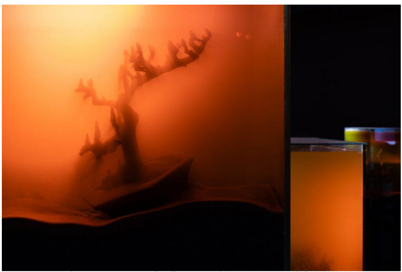
Various artists, toxiThropea.sunset, 2019, Deadly Affairs (23 March–30 June 2019), Kunsthal Extra City, Antwerp.

Deadly Affairs aimed to dissect how the unequal distribution of environmental catastrophes is intertwined with capitalism, imperialism, and race. We used the tropes of toxic trades and destruction to untangle the complex conditions that make its violence possible, and above all legally, socially, and culturally acceptable. At the heart of the exhibition were these malevolent processes of "normalization." We tried to emphasize how local populations often accept hazardous and toxic industrial endeavors in exchange for promises to solve unemployment and poverty. Valentino Bellini, in collaboration with Eileen Quinn, addressed this by merging investigative journalism, archival materials, interviews, and photographs related to the disastrous history of the petrochemical area of Syracuse in Sicily, and what remains of it in the environment, in human bodies, and in memories.