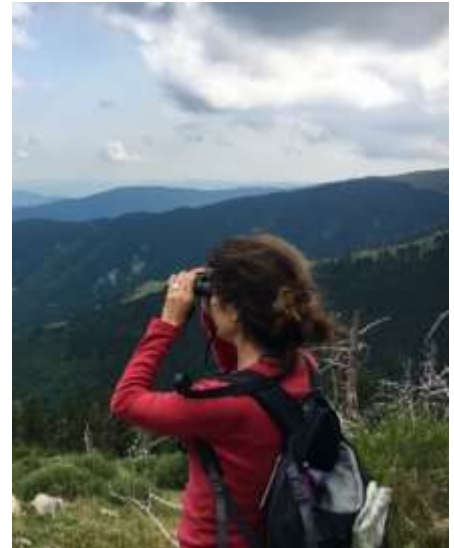
The author birding on the French-Spanish border, July 2017.

There are effectively two categories of participants in the “lost and found birds sydney” Facebook page: seekers, whose pets have gone missing, and finders—usually random people like me who came across a bird in distress. Without necessarily being conscious of it or articulating it as such, finders are engaged in what theorists describe as the “ethical practice of care,” defined as having an emotional response, being compelled to assist, and taking action in a meaningful way. 13 Posts on the page show this practice playing out multiple times a day. Indeed, it is the unspoken principle upon which the whole enterprise rests. Passersby notice a bird where it would not normally be and take it upon themselves to report it or even transport it to a vet, making it possible for the bird to be reunited with its owner.