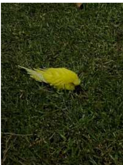
Earthbound budgie in Jubilee Park, Sydney (close-up).

Late one evening soon after I had arrived in Australia for a sabbatical, I was out strolling with my daughter through a Sydney park, seeking relief from the summer humidity, when something yellow on the ground caught my eye. We stopped to take a look. It was a bird. Small, disheveled, its feathers neon bright in the glare of a nearby lamppost, the creature appeared out of place. It was vaguely pecking at the grass, but when it pitched forward clumsily, it was clear it needed help. My daughter and I debated what to do. Should we capture it? How? Even if we could, what would we do with it? Other people walked past, deep in conversation, unaware of the drama unfolding inches from their feet. Lacking my glasses, I tapped “lostt brid rexsue?” into my phone’s search app and snapped a location photo just as the bird abruptly rose and flapped unsteadily into a tree, high out of reach.