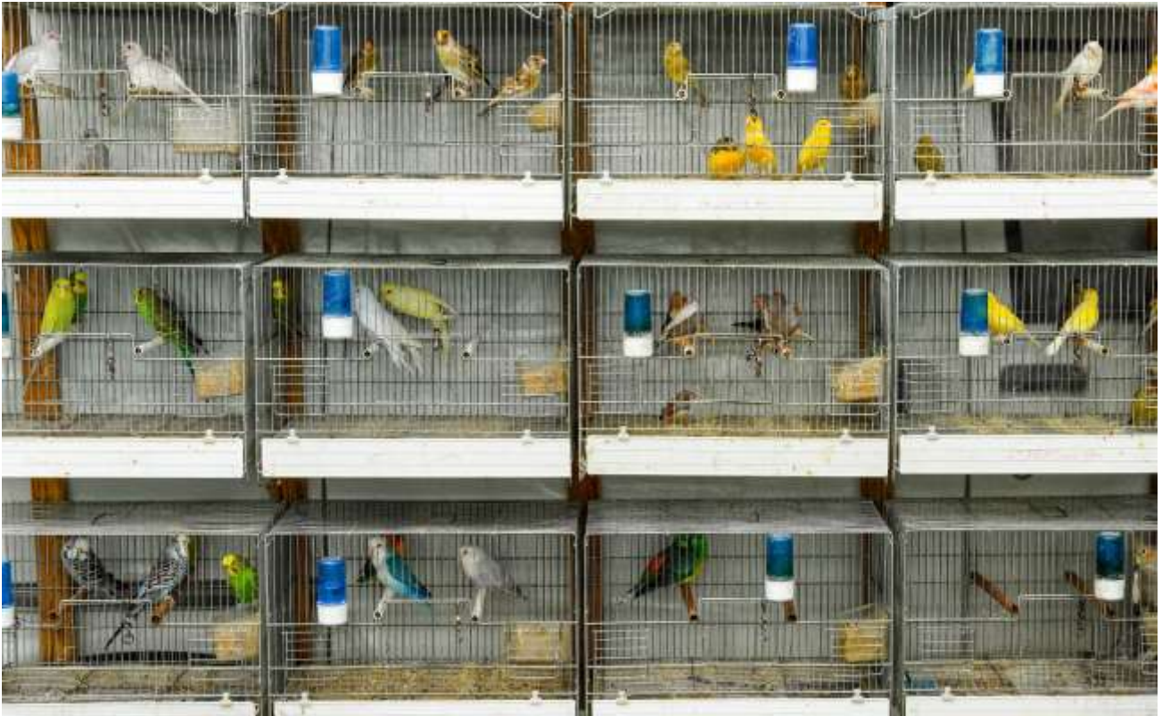
Caged birds for sale on a street market in Italy.

Worldwide, the statistics on parrots are extraordinarily grim. According to a recent estimate by the World Parrot Trust, as many as half the parrots on the planet live in captivity. 19 Even as a rough tally, based on an approximation of fifty million in private ownership, zoos, and breeding centers and a roughly equal number in the wild, the implications are shocking. 20 The proportion varies widely by species, depending on their popularity as pets and ability to reproduce in confinement. The African grey parrot ( Psittacus erithacus ), for example, has been highly prized as a caged bird for more than five centuries and can be bred in captivity. Nevertheless, one hundred thousand are captured and exported from West Africa for the pet trade every year, to the point that the African grey is now listed as endangered in the wild by the IUCN. 21