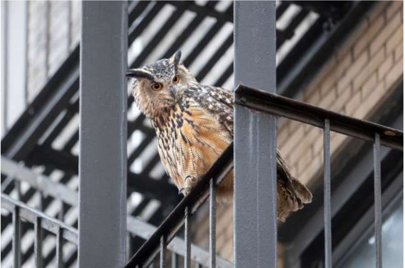
Flaco lounging on a Manhattan fire escape, New York, 3 January 2024.

they can also be understood as expressions of humans' innate interest in "the big wide world . . . of bumptious life," to use Donna Haraway's phrase, and of the universal human desire for closeness and connection with other beings, feathered or otherwise. 10