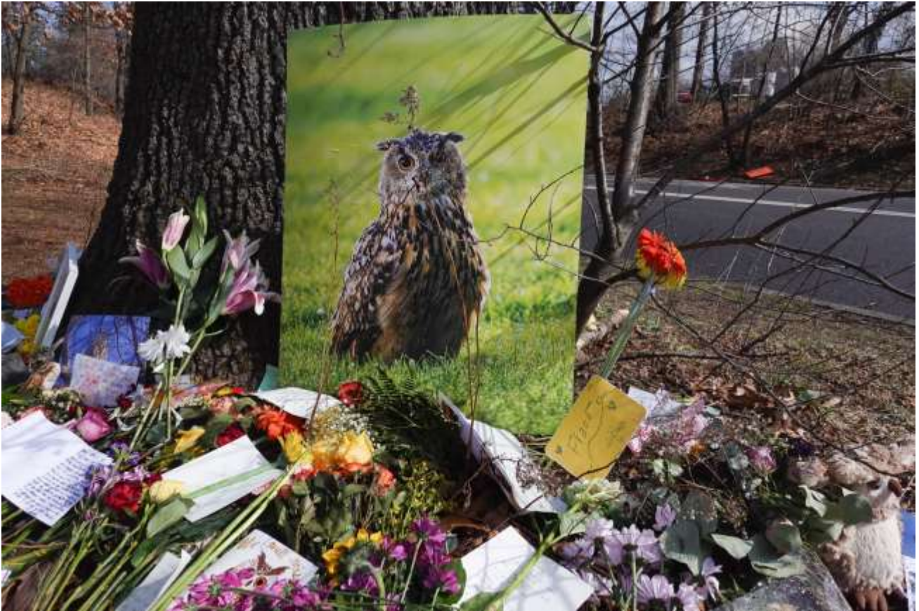
New York City, 26 February 2024: New Yorkers made a makeshift vigil in Central Park for Flaco, a Eurasian eagle owl who escaped his long-time enclosure at Central Park Zoo in 2023 and passed away after nearly a year of freedom.

Observing the outpouring of public responses to his death, from national news reports and editorials on its meaning to heartfelt online odes and handmade portraits left at the base of Flaco's favorite oak, 7 I was struck by the intensity of people's sense of loss. "You moved us all, we loved you so much. We are so glad you had a year of freedom," wrote one of the many mourners who left messages by the tree. 8