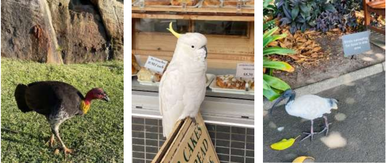
(Left) A brushturkey at Manly Beach in Sydney. (Center) A bakery-loving cockatoo in Katoomba, New South Wales. (Right) A white ibis strolling past a warning sign in the Royal Botanic Garden Sydney.

viewing, and sensory engagement. Though tiny in the grand scheme of things, these sites nonetheless provide a critical lifeline for birds. To keep them going, organizers are keenly aware that capturing and sustaining human interest must be part of the equation. However, without a Bird of the Year or Flaco, such projects, too, can struggle over time.