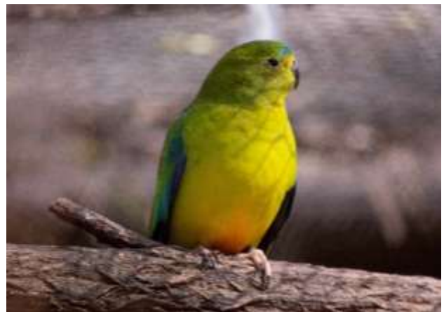
(Left) An African grey parrot sitting on top of its cage. (Right) An orange-bellied parrot. This image has been cropped.