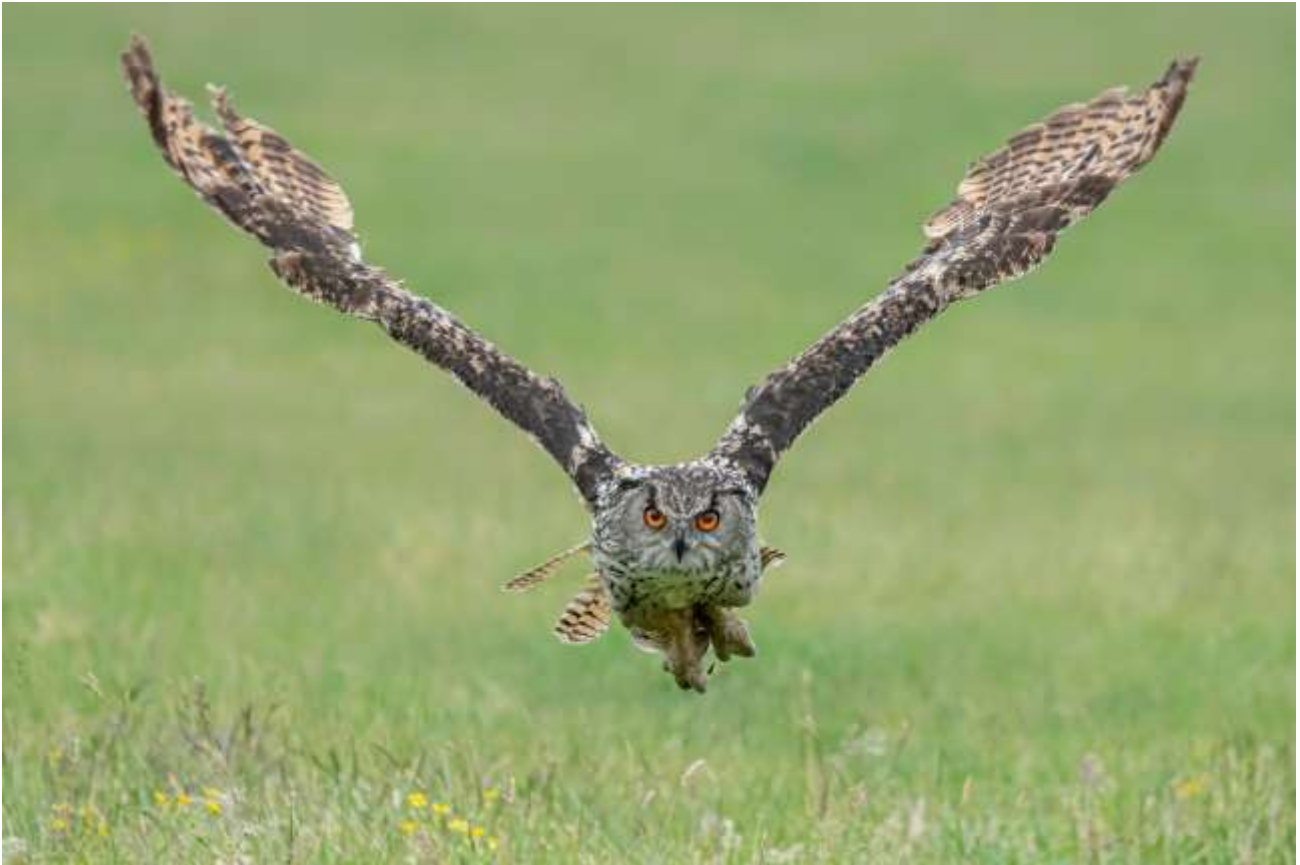
Eurasian eagle owl in the Netherlands.

Eurasian eagle owls are listed by the International Union for Conservation of Nature as a species of least concern; which is not to say no concern. There are no current coordinated monitoring programs across their vast range, which extends from Scandinavia and southern Europe to East Asia, nor are reintroduction efforts in progress. Nonetheless, Eurasian eagle owls' numbers have been in decline for decades due to an assortment of intentional and inadvertent human actions: poisoning, egg theft, high-voltage power-line strikes, habitat encroachment by Alpine tourism, and more. 16 Flaco's charismatic presence in Central Park could have been an opportunity to educate the public about the magnitude of species declines worldwide and the manifold challenges birds encounter on a warming planet of eight billion people. Instead, he was mostly championed as a tough and tenacious New York personality, the type urban denizens claim as their own and miss when they are gone.