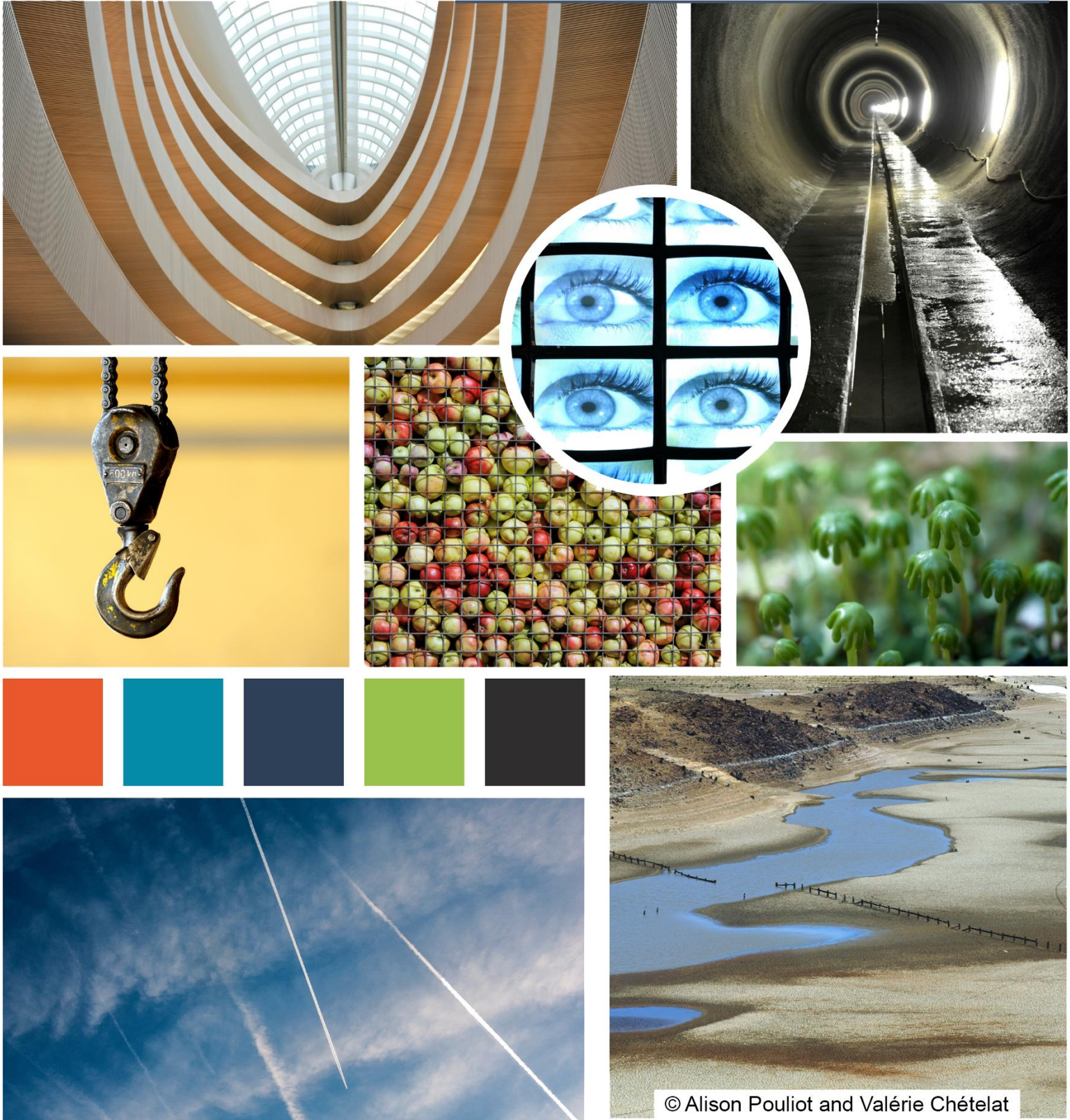
© Alison Pouliot and Valérie Chételat