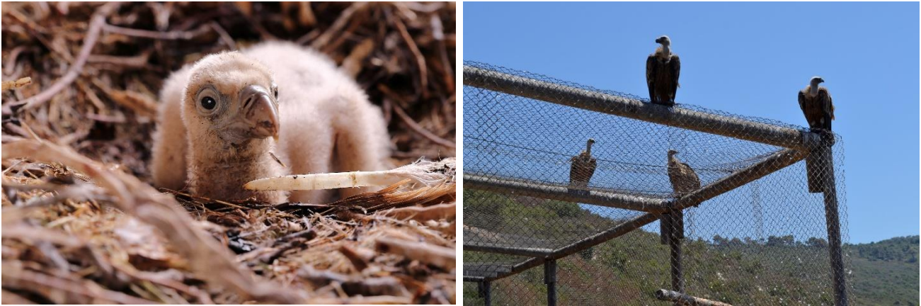
Fig. 3. (Left) A griffon vulture chick. (Right) Griffon vultures on top of their special training cage in the Carmel Mountains, Palestine-Israel.

There are currently 220 vultures in Palestine-Israel. They are intensively managed using various forms of digital conservation. The chief ornithologist for Israel's Nature and Parks Authority told me accordingly: "I cannot think of any other animal on this planet with such high monitoring rates. We have about 80 percent monitored by GPS and 75 percent of the vultures are tagged, meaning we know their history and we also [genetically] sample each one." 13 Through this digital monitoring, an enormous body of data is accumulated about the vulture's location, body temperature, and movement. Specifically, acceleration data that identifies movement is analyzed to extract nuanced information about vulture behavior. This type of study is situated within the field of movement ecology, which promotes an understanding of movement patterns and their role in various ecological and evolutionary processes. Such complex conservation projects necessitate engagement with computer science, paradoxically distancing biologists from the very sites and materialities of their research. The alienation that occurs with such conservation management by algorithm highlights that "digital data enables and encourages the automation of conservation decisions." 14