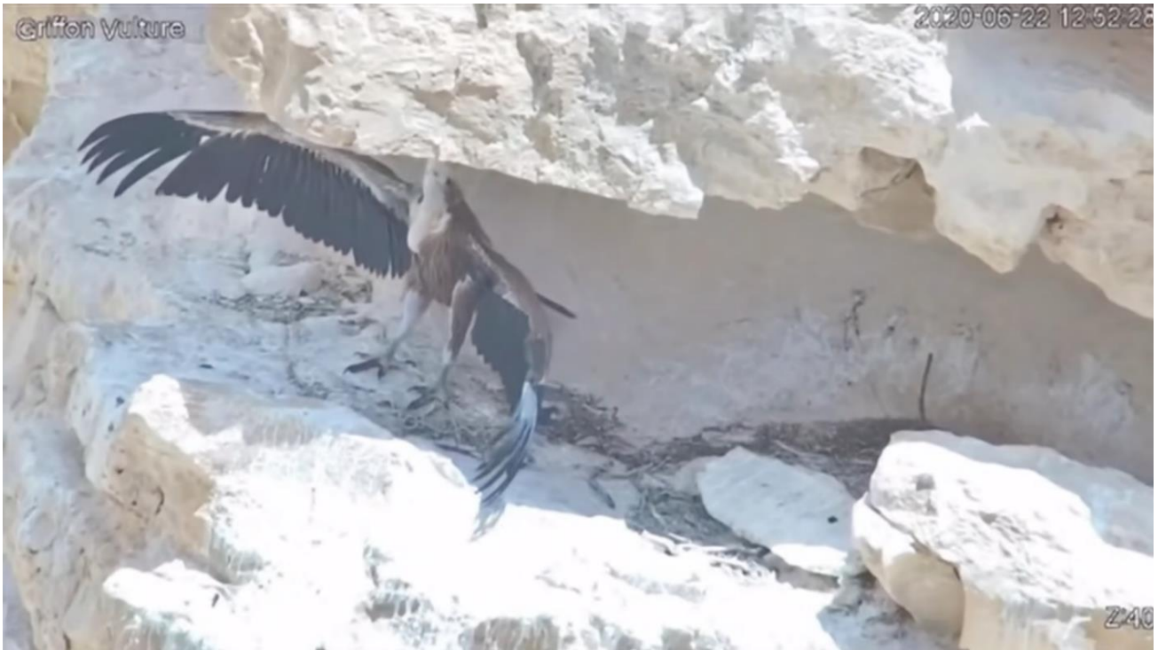
Fig. 2. After his mother died by electrocution, an endangered vulture chick is fed by "Mother drone," an advanced technology operated by the Israeli army.

This three-minute news item encapsulates the three-way dance between conservation, digital technology, and the Israeli army. The blurred classified drone, the obscured military general, and the three men—from high tech, conservation, and the military—congratulating themselves on their mothering skills, all occurred at one of the most visited national parks in Palestine-Israel, Ein Avdat in the southern Naqab-Negev desert, and was broadcasted live to the Israeli public via a 24/7 camera installation. This was not the first, nor would it be the last, collaboration between Israeli conservationists and the army.