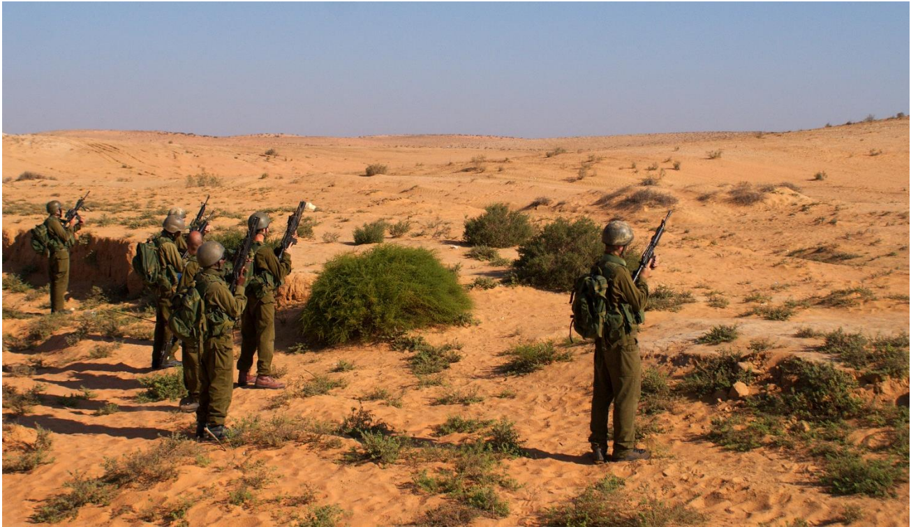
Fig. 1. Israeli soldiers exercise in a desert.

In July 2020, Israeli television reported on an endangered griffon vulture ( Gyps fulvus ) chick who had lost his mother to electricity wires. As would soon become clear, the chick's father was unable to provide enough food to ensure his son's survival. The Israeli army, referred to by most Israelis as the Israel Defense Forces (IDF for short, or Tsahal in Hebrew), readily stepped in, using a state-of-the-art drone technology to drop daily offerings of rat food for the chick by deftly managing the intense cliffs. "Mother drone," as the army referred to this technology, was blurred in the video that documented the operation. It had to be, the reporter explained, because it "belongs to the Israeli army and is classified as top secret." Standing with his back to the camera, the military general in command told the reporter about the countless hours spent practicing the delivery on a mock-up of the ledge and nest before the military started food drops for real. The report ended with the following statement: "The collaboration between a tech company, the military, and conservationists got the ultimate endorsement this week when the chick flew for the first time. Job [well] done!" (Figure 2). 1